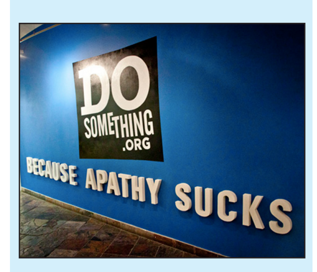
(Pictured: Office at DoSomething)

We match volunteering individuals with volunteer, social change and civic action campaigns to make a real impact in the real world.